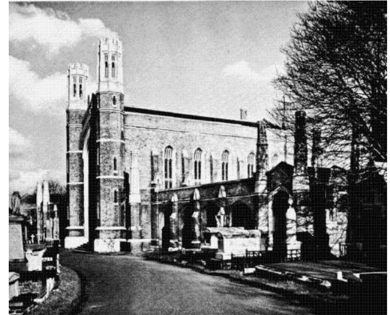
The original chapel and West Norwood Cemetery