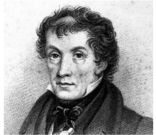
John Claudius Loudon

Loudon was a prolific horticultural and landscape design writer. Through his publications, he hoped to spread his ideals of the creation of common space and the improvement of city planning and to develop an awareness and interest in agriculture and horticulture. Through his magazines and works, he was able to communicate with lay folk as well as other professionals. His final focus for his attentions was on the layout and creation of public parks and cemeteries. A series of articles on cemetery design, criticising various aspects of the layout and management of the new cemeteries which had been opened in the preceding 20 years, and advocating grid layout and evergreen planting, was published in the Gardener's Magazine in 1843, to be published towards the end of the year as On the Laying Out, Planting and Managing of Cemeteries . 03