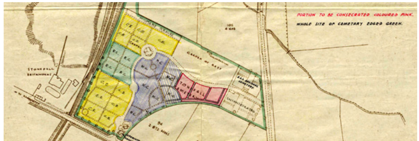
The Cemetery at Harrogate (now Stonefall Cemetery) shows the layout of different denominational plots ( https://www.york.ac.uk/spsw/research/cemetery-research-group/about-cemeteries/select-bibliography/ )

The cemeteries were divided up to serve the community. Separated out into plots for different denominations and providing a service for each type, there were often two or three chapels. They were also designed to have offices on site for the gardening team and registrars and spaces for management records, the new designs were carefully planned and maintained and there were prices for different services attached to each kind of burial plot. This was all in the hope that people would be willing to pay that bit more for burying their dead in this new form of commercial enterprise.