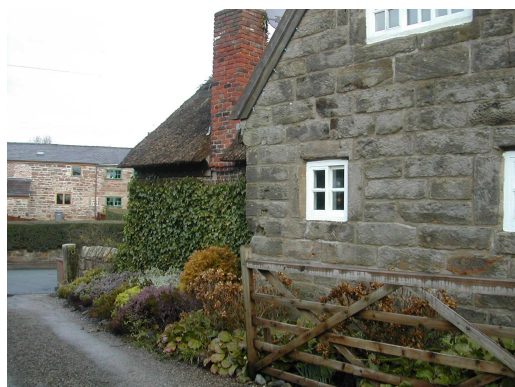
A typical timber gate and gravelled drive maintain the rural character of the conservation area.