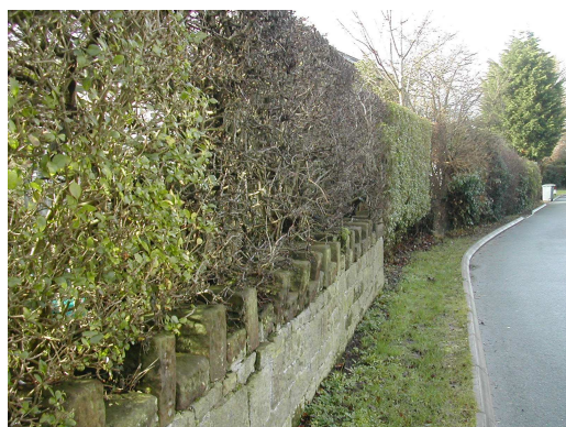
Stone boundary walls backed by a traditional clipped privet hedge and an informal mixed hedge of native species.