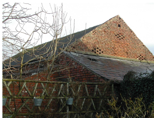
Pitching eyes and ventilation holes are typical features of traditional agricultural buildings.