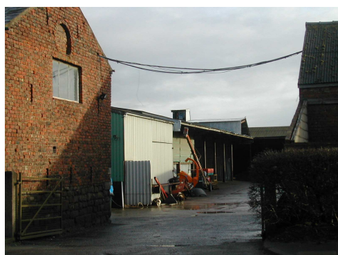
An enclosed working farmyard to the rear of Diamond Farm has existed since at least 1870.

3.2.4 The two working farms, Diamond Farm and Prospect Farm have yards behind the historic farm buildings, surrounded by modern agricultural buildings. Views into these enclosed working spaces are glimpsed from the public realm.