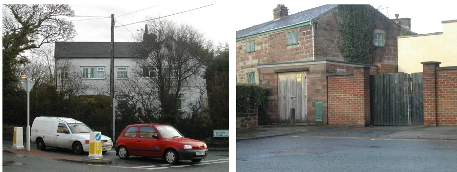
The junction of Saughall Road and West Kirby Road is marred by a poor quality public realm.

6.6.1 Saughall Massie has seen a significant reduction in through traffic since the construction of the bypass. The presence of traffic signage, lighting columns, road markings and bollards however intrude on the streetscape and detract from the setting of buildings in the centre of the village.