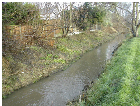
The Arrowe Brook forms the eastern boundary of the conservation area.