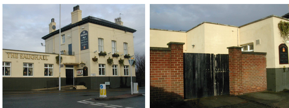
Poorly chosen materials and an ungainly design make the extension and boundary treatment of The Saughall an unfortunate feature in the heart of the conservation area.

6.4.2 The large flat roofed extension to The Saughall public house is not a visual success. Its prominent location at the heart of the village only serves to emphasise its ungainly appearance. Boundary walls to the pub are also unfortunate, being constructed in a modern brick, different in colour, form and texture to other materials in the village.