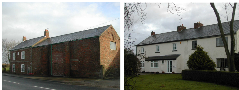
The relationship of buildings to the road varies. Diamond Farm sits at the back of pavement while Ash Tree Cottage is set behind gardens.

surrounded by subsidiary buildings. Many of the buildings sit at different angles and there is no distinct building line.