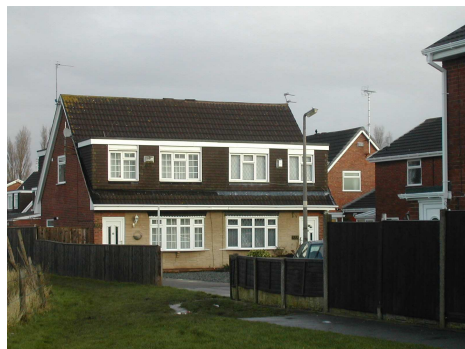
Pleasant but anonymous suburban housing immediately to the east of Saughall Massie village.