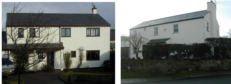
Late 20 th century houses which use the language of the local vernacular.