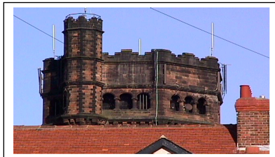
Fig 4. Apparatus adversely affects character of listed building

4.8 Development affecting designated sites such as listed buildings and conservation areas is unlikely to be acceptable if their character, appearance or setting would be adversely affected. Operators should demonstrate that alternative sites have been fully explored and are not feasible before these options are considered.