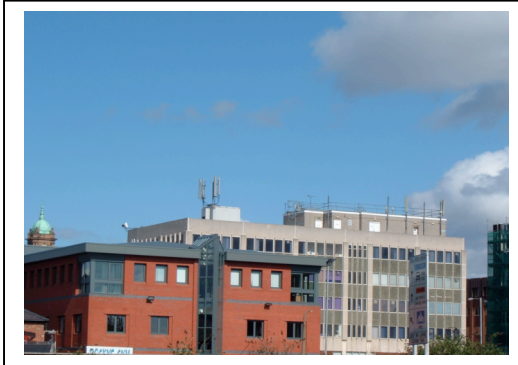
Fig 2. Antennae fitted flush to original elevations would have reduced the impact on this building.

materials to be used. For example, an extensive array of antennae projecting above the roofline in prominent or distinctive locations will not be acceptable.