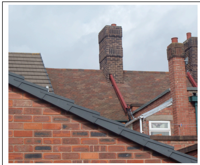
Fig 1. Acceptable use of shrouding on chimney to conceal antennae

4.5 Apparatus can be designed so that it is barely recognisable on the existing structure. It can be camouflaged or concealed in street furniture. Good examples of how telecommunications equipment has been installed on buildings and structures throughout Wirral include the use of church towers, flag poles, electricity pylons and chimney stacks.