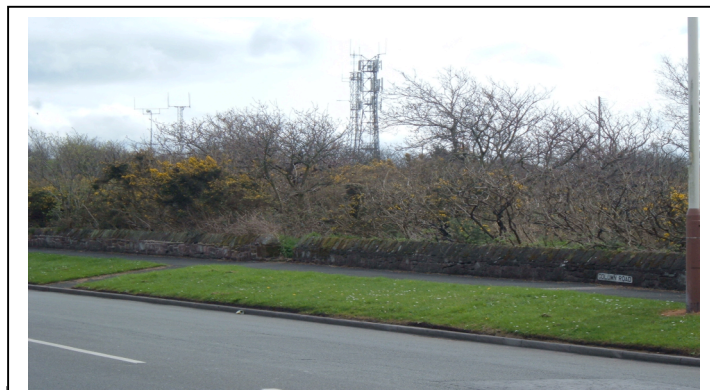
Fig 5. Use of replica trees could reduce impact here.

4.11 Care must be taken that development including new access routes does not damage or adversely affect the appearance of adjoining landscapes. Applicants must demonstrate that all works and exclusion zones around retained trees and hedgerows would comply with BS5837 (2005).